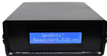
Real Time LCD Display

Does not require expertise, just plug the sensor, and turn on the device: Always stable