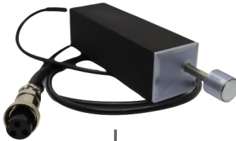
30 mm Capacity

Start measuring in minutes with easy fastening components and magnetic contact detail